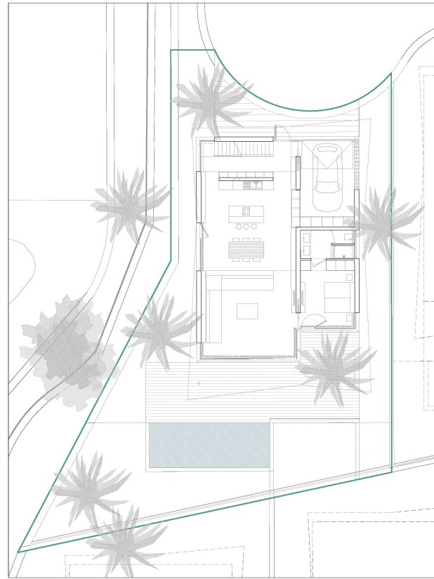
URBANIZATION / URBANIZACIÓN